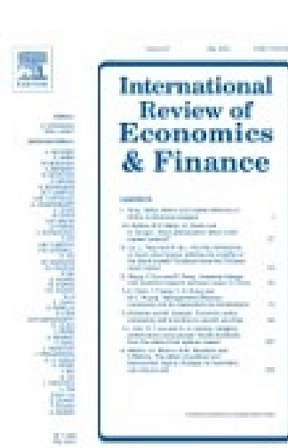
International Review of Economics & Finance