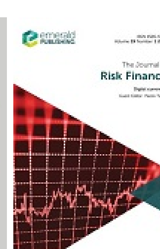
Journal of Risk Finance