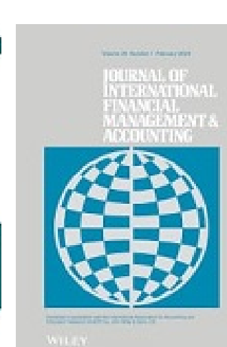
Journal of International Financial Management & Accounting