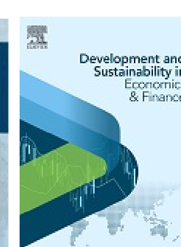
Development and Sustainability in economics and finance